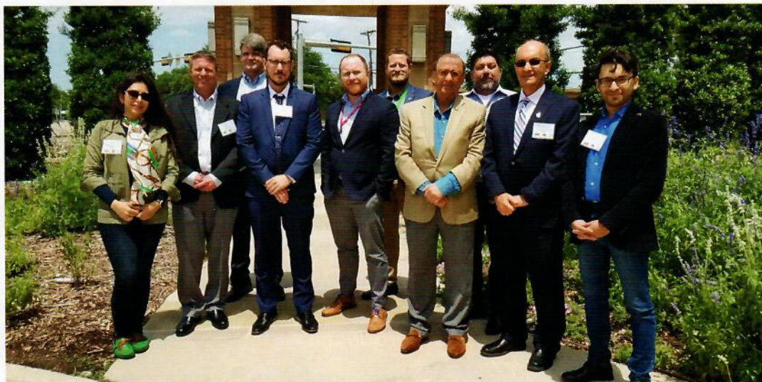
TTP 2019 Organizers with Scholarship Recipients

Upon completion of above events, attendees received a certificate of completion and a PDF copy of all presentations on a USB drive. For more information on future events, call CUIRE at (817) 272-9177 or email cuire@uta.edu or visit www.cuire.org .