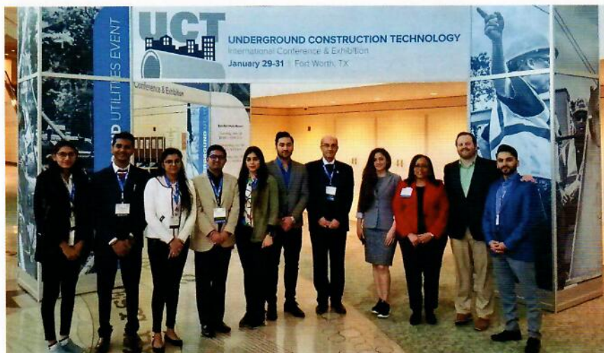
CUIRE Research Team with UCT Organizers

There were 63 professionals attending these courses. The instructors were industry experts and included CUIRE board members and friends.